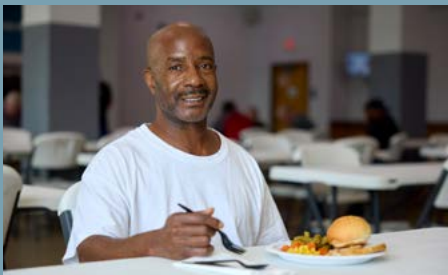
Love Your Neighbor Page 2