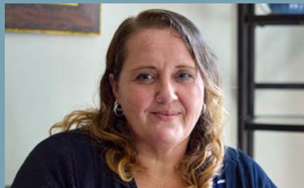
"I learned to walk with God." Page 3