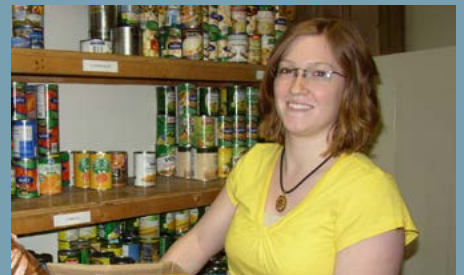
Volunteer: Be the hands and feet of Jesus Page 4

For more information: (816) 474-9380 cityunionmission.org