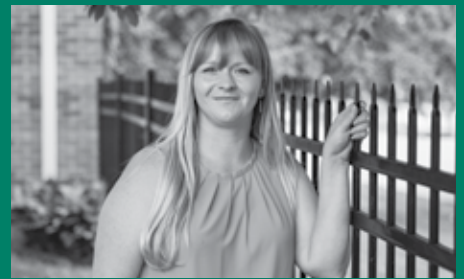
"The cycle has been broken." Page 3

For more information: (816) 474-9380 cityunionmission.org