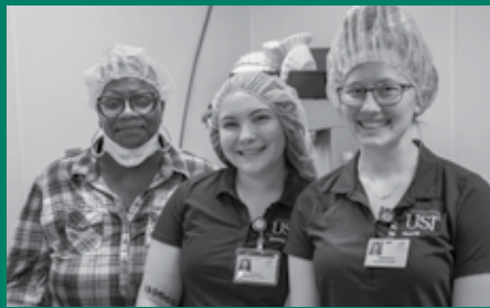
You make Christmas at the Mission special! Page 2