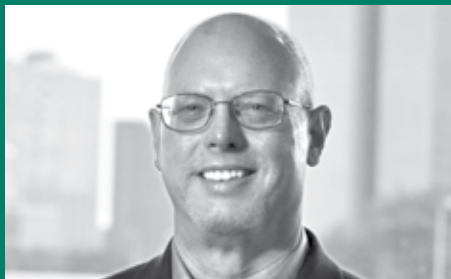
Celebrating the HOPE of Christmas Page 2